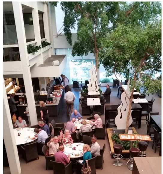
(above: our weekly breakfast venue Mantra Pavilion)

26 Nov Bidgee Dragons, Apex Park, catering from 7am 28 Nov Shine Awards 2 & 3, 9 & 10 Dec Selling Xmas trees at Bunnings 9 Dec BBQ at Bunnings